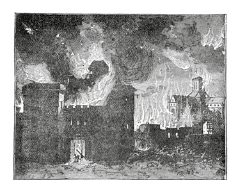
The Great Fire of London

Fire safety measures include those that are planned during the construction of a building or implemented in structures that are already standing, and those that are taught to occupants of the building.