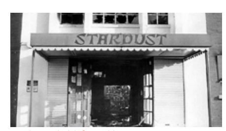
Stardust Nightclub fire, Dubli